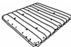
BULTEX MATTRESS 1 MATTRESS 140 x 200